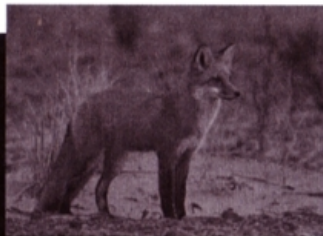
Red Fox

In celebration of migration, Spring Fling is held the last full weekend in April. Tours, programs and owl banding are highlights of the event.