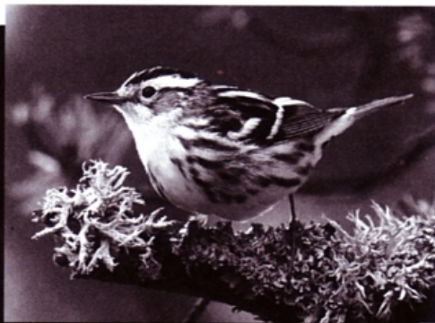
Black and White Warbler

Visit the Owl's Roost or on our website for current and ongoing activities. To find out what birds are being seen at the Point, read the WPBO blogs that are maintained daily by our research staff. Also visit our on site gift shop for wonderful bird and nature related items.