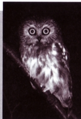
Saw-whet Owl

Raptor migration begins in mid-March, with highlights of Bald Eagles and Northern Goshawks. Mid-May peaks with thousands of Sharp-shinned and Broad-winged Hawks. Golden Eagle, Osprey, Rough-legged Hawk, Merlin, Peregrine Falcon and Northern Saw-whet Owls are regularly seen. Perhaps even a Boreal or Great Gray Owl will be discovered.