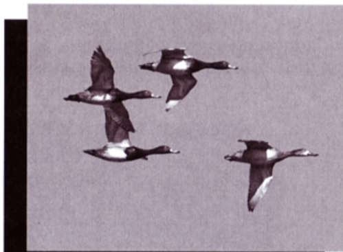
Redhead Ducks

Located on the shore of Lake Superior in Michigan's Upper Peninsula, Whitefish Point is a phenomenal concentration spot for migrating birds. The beaches and dunes support a unique plant community and a variety of unspoiled natural habitats exists nearby.