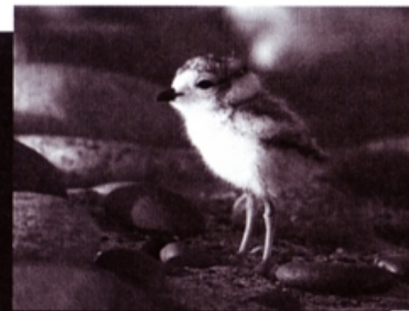
Piping Plover chick

Although birds are not abundant at Whitefish Point in the winter, the possibility of finding unusual northern species is relatively good. Search for Great Gray, Northern Hawk and Snowy Owls, Gyrfalcon, Gray Jay, Boreal Chickadee, Bohemian Waxwing, Pine Grosbeaks, crossbills and redpolls.