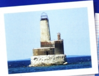
Waugoshance Shoal Light