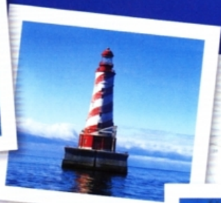
White Shoal Light