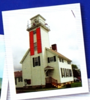
Cheboygan River Front Range Light