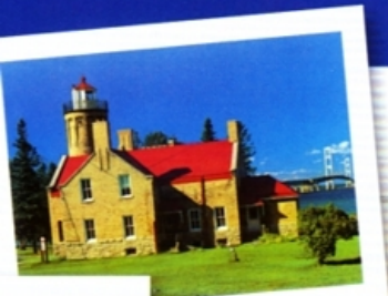
Old Mackinac Point Light