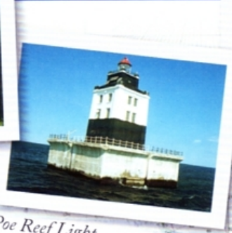
Poe Reef Light