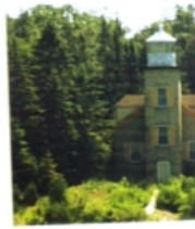
Bois Blanc Island