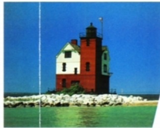
Round Island Light