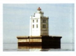
Martin Reef Light