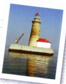
Spectacle Reef Light