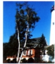
St. Helena Island Light