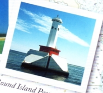
Round Island Passage Light