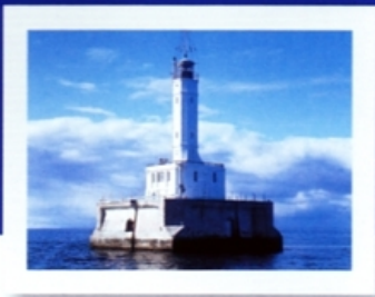
Gray's Reef Light