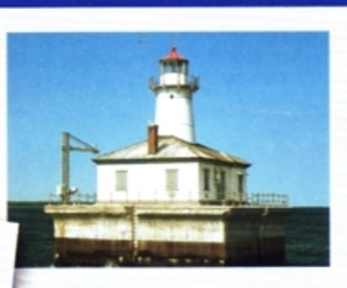
Fourteen Foot Shoal Light