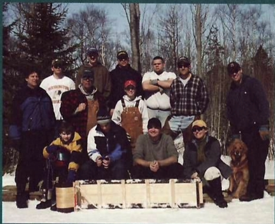
Lake Superior State University Fish and Wildlife Club with Conservancy stewardship staff, Winter 2005.

Special thanks to the many community members for their cooperation in assisting with trail construction, preserve management, and maintenance including: Bay Mills Township, Soo Township, teachers, students, neighbors, preserve monitors, and trail stewards.