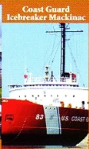
Coast Guard Icebreaker Mackinac

leaving every 30 minutes with pickup & dropoff at many hotels & restaurants