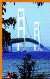
the Mackinac Bridge