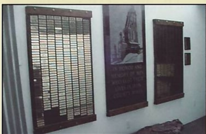
4 IRON MINING MEMORIAL ROOM