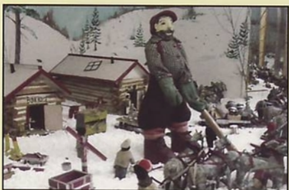
7 LOGGING MINIATURES (Largest in the world)