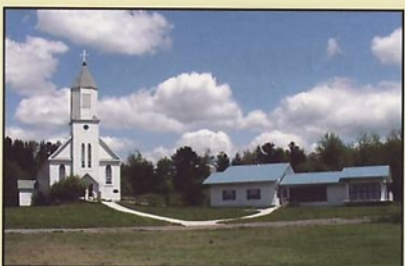
8 ART COMPLEX (2 galleries)