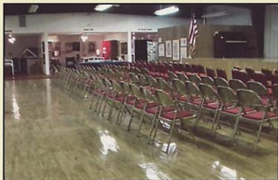
1 MAIN BUILDING - CULTURAL CENTER AND GIFT SHOP