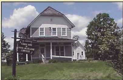
2 VICTORIANA - CARRIE JACOBS-BOND HOME AND PIONEER SCHOOL