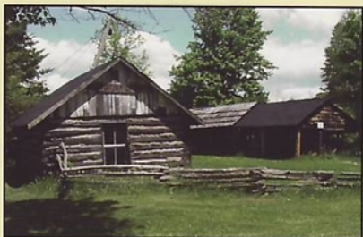
6 LOGGING CAMP