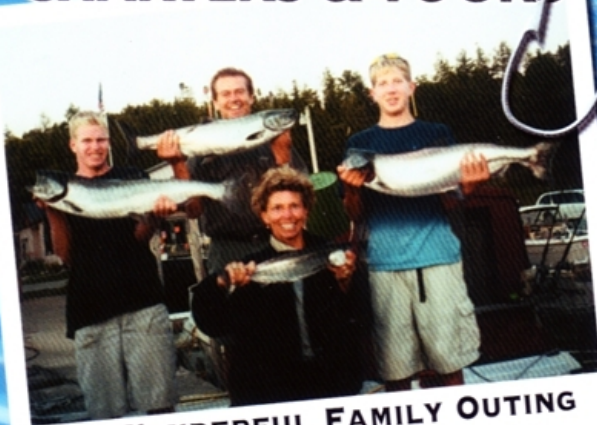
A WONDERFUL FAMILY OUTING FROM DRUMMOND ISLAND