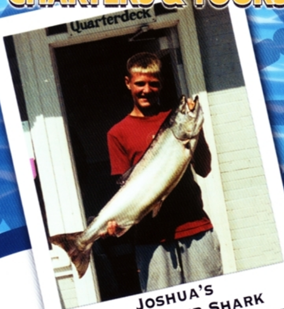
JOSHUA'S FRESHWATER SHARK