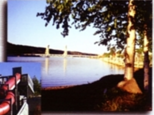
West end of the waterfront trail

The Waterfront Park is considered by many to be the recreational hub of Houghton. Offering RV camping, swimming, picnic grounds, playground, a band shell and pavilion