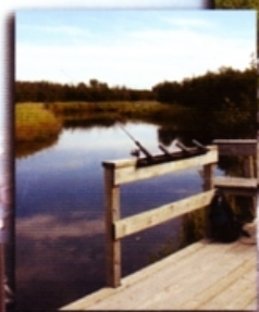
Nara Nature Park

The award winning Waterfront Trail serves as a 4 mile paved avenue for walkers, cyclists, skaters, and joggers. Linking Waterfront Park, downtown Houghton, MTU campus, Peepsock and Nara Nature Parks, it offers a safe and quiet place to exercise and enjoy nature