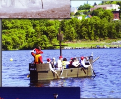
Bridgefest's Great Cardboard Boat Regatta