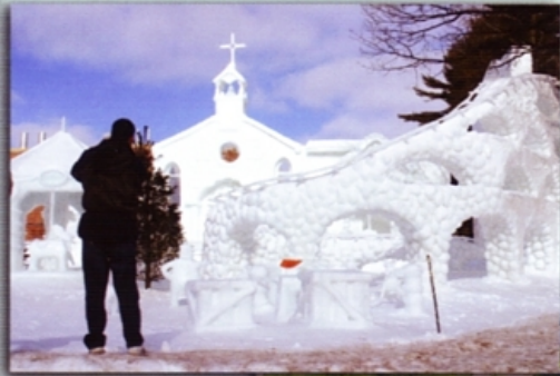
MTU's Winter Carnival