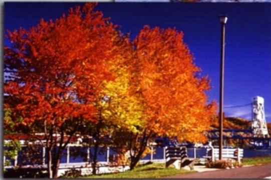
Fall Color Tour

SMART Michigan Tech Enterprise Corporation ZONE