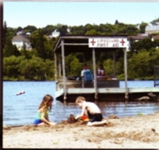
Public Swimming Beach