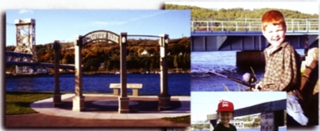
East of the bridge, Bridgeview Park offers more public docks, fishing piers, picnic areas, and part of the Historic Houghton Walking Tour

The award winning Waterfront Trail serves as a 4 mile paved avenue for walkers, cyclists, skaters, and joggers. Linking Waterfront Park, downtown Houghton, MTU campus, Peepsock and Nara Nature Parks, it offers a safe and quiet place to exercise and enjoy nature