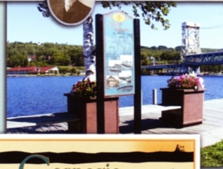
Historic Houghton Walking Tour