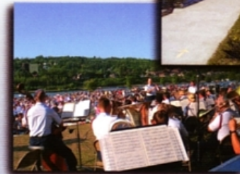
Weekly Concerts in the Park