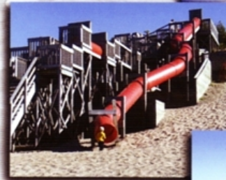
Chutes & Ladders