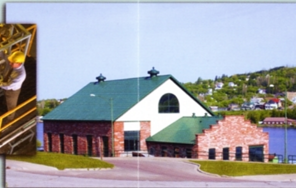
MTEC's "Powerhouse" Business Incubator